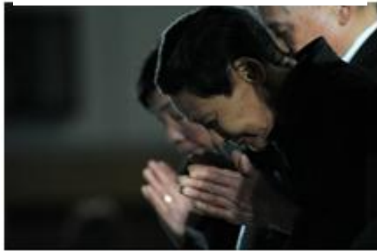
People praying at the memorial ceremony (March 11, 2012)