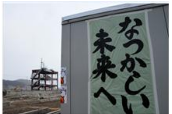
Message pasted on the wall of the Chiba Seaweed Store reads: "To the future we once knew."