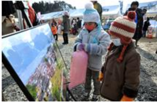
Children viewing photos of Minamisanriku before the tsunami