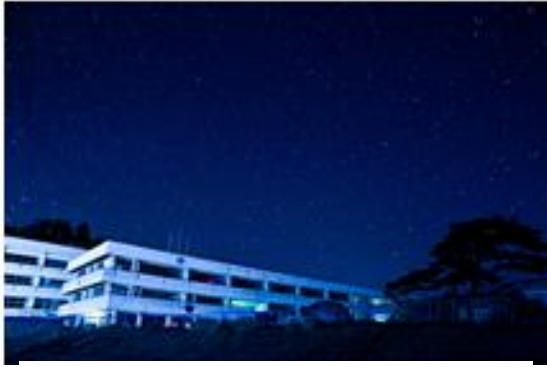
Abroad, starry on New Year's Eve (Shizukawa Primary School)